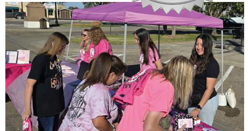
PMC team members participated in the "Beers and Brats for Boobies" 5K event.