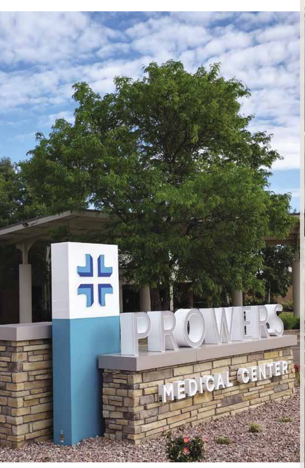
REPORT TO THE COMMUNITY 2020